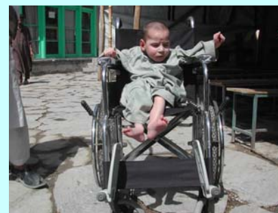
Afghanistan Disabled Children