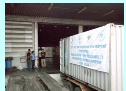
2 Containers of Wheelchair shipment were ready to be shipped from Thailand to Afghanistan