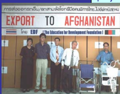
The Wheelchairs were packed at Thai Wheel Factory in the presence of EDF and WAFCAT delegates